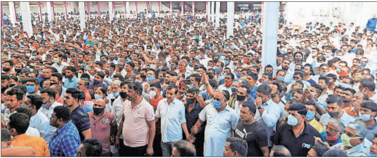
Supporters of MP Mohan Delkar gather in Silvassa as his body was brought from Mumbai on Tuesday.